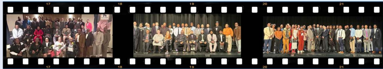
Class 166 41 parents, impacting 103 children 10 YLDP graduates