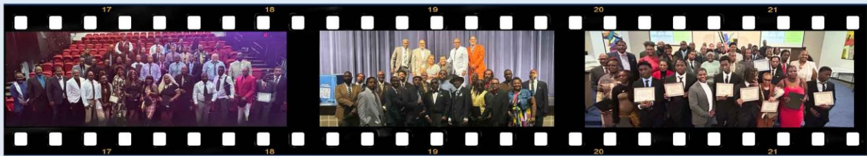
Class 169 41 parents, impacting 103 children 10 YLDP graduates